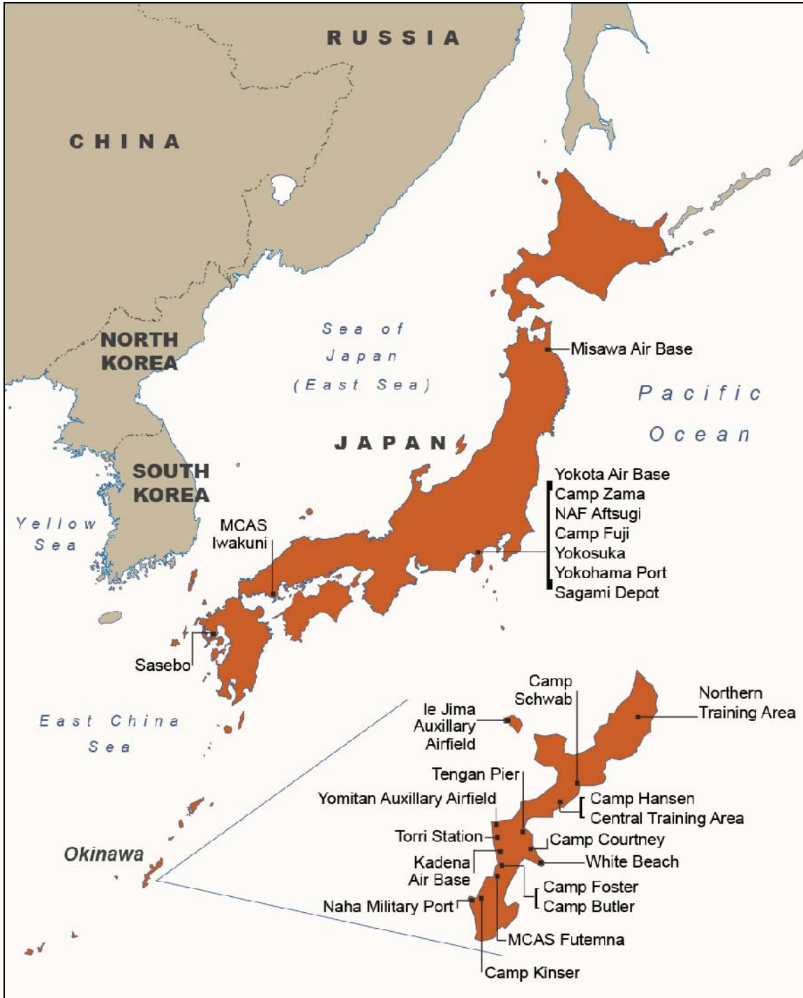
Figure 2. U.S. Bases in Japan

U.S. bases is approximately 77,000 acres; United States Forces Japan (USFJ) facilities range in size from a several thousand acre training area to a single antenna site. On mainland Japan, there are seven different bases/posts. Yokota and Misawa, representing the Air Force; Camp Zama, representing the Army; Iwakuni, the Marine Corps; and Yokosuka, Atsugi, and Sasebo, the Navy.